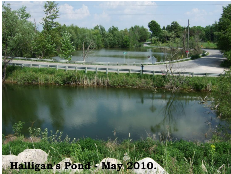
Halligan's Pond - May 2010.